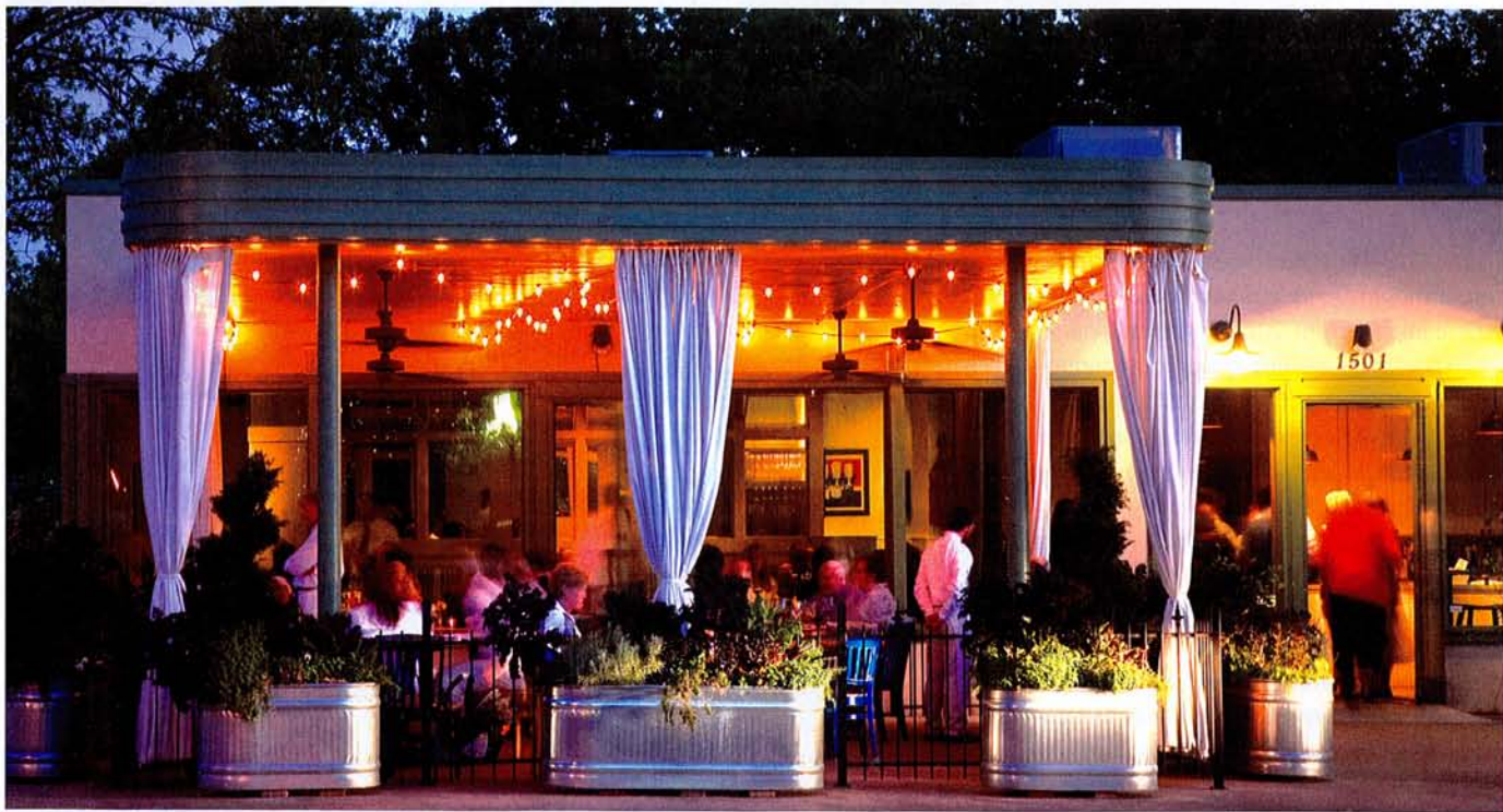
(Clockwise from top) Ellerbe Fine Foods is a 1920s gas station-turned-restaurant. Guests flock there for its seasonal menu and outdoor dining. Zed's patio takes advantage of Texas breezes. Avanti Fountain Place restaurant offers views of a world-class water feature. Ellerbe Fine Foods pairs fresh herbs with local ingredients for its seasonal menu.

AL FRESCO DINING MAKES THE HAPPY HOUR—HAPPIER. There's something about mingling, sipping and eating outdoors that sets the mood and instantly raises the stakes. Now that warmer weather is here, event-goers will welcome the revival of dining en plein air . And with so many stellar outdoor venues, blue skies are ready to offer a cameo appearance guests are sure to recall long after the event comes to a close.