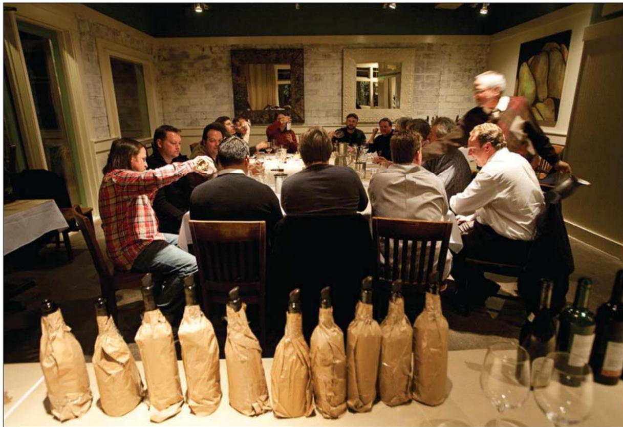
Tables are pushed together and the guys take their places. Let the tasting begin.